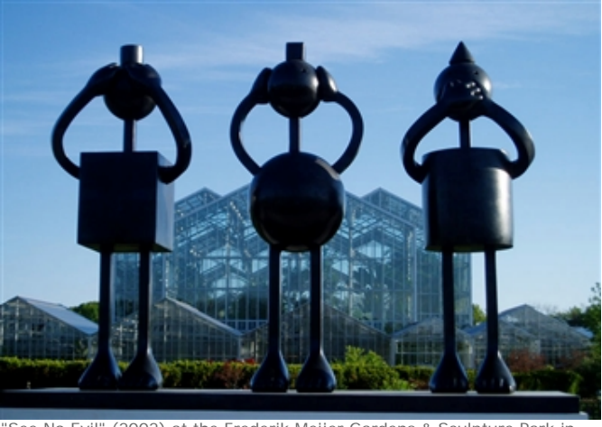
"See No Evil" (2002) at the Frederik Meijer Gardens & Sculpture Park in Grand Rapids, Mich. (main entrance) Tom Otterness