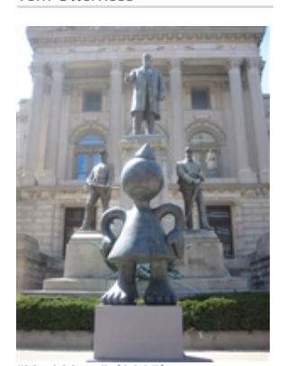
"Mad Mom" (2005) Indianapolis, City Hall Tom Otterness

Images (numbered from top): courtesy of Frederik Meijer Gardens & Sculpture Park (1,9); photo by Bruce Schwarz (2); photo by D. James Dee (3,4,6); photo by Patrick Cashin (5); photo courtesy of Macy's East (7); photo by Janis Gardner Cecil (8)