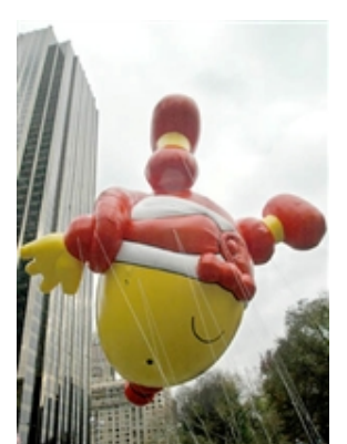
"Humpty Dumpty" at the Macy's Thanksgiving Day parade (2005) Tom Otterness